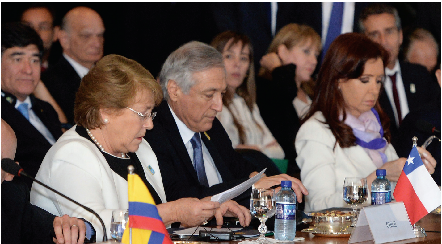
The Presidents of Chile, Michelle Bachelet, and Argentina, Cristina Fernández, during their participation at the BRICS UNASUR Summit in Brasilia.