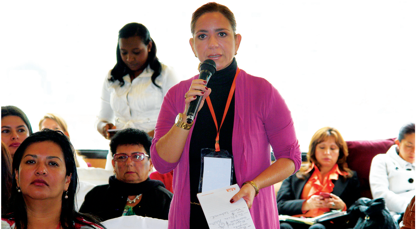
National Summit of Women Elected in Colombia organized by the Ministry of the Interior, UNDP, UN Women, International Cooperation Gender Group, NDI and IDEA International.