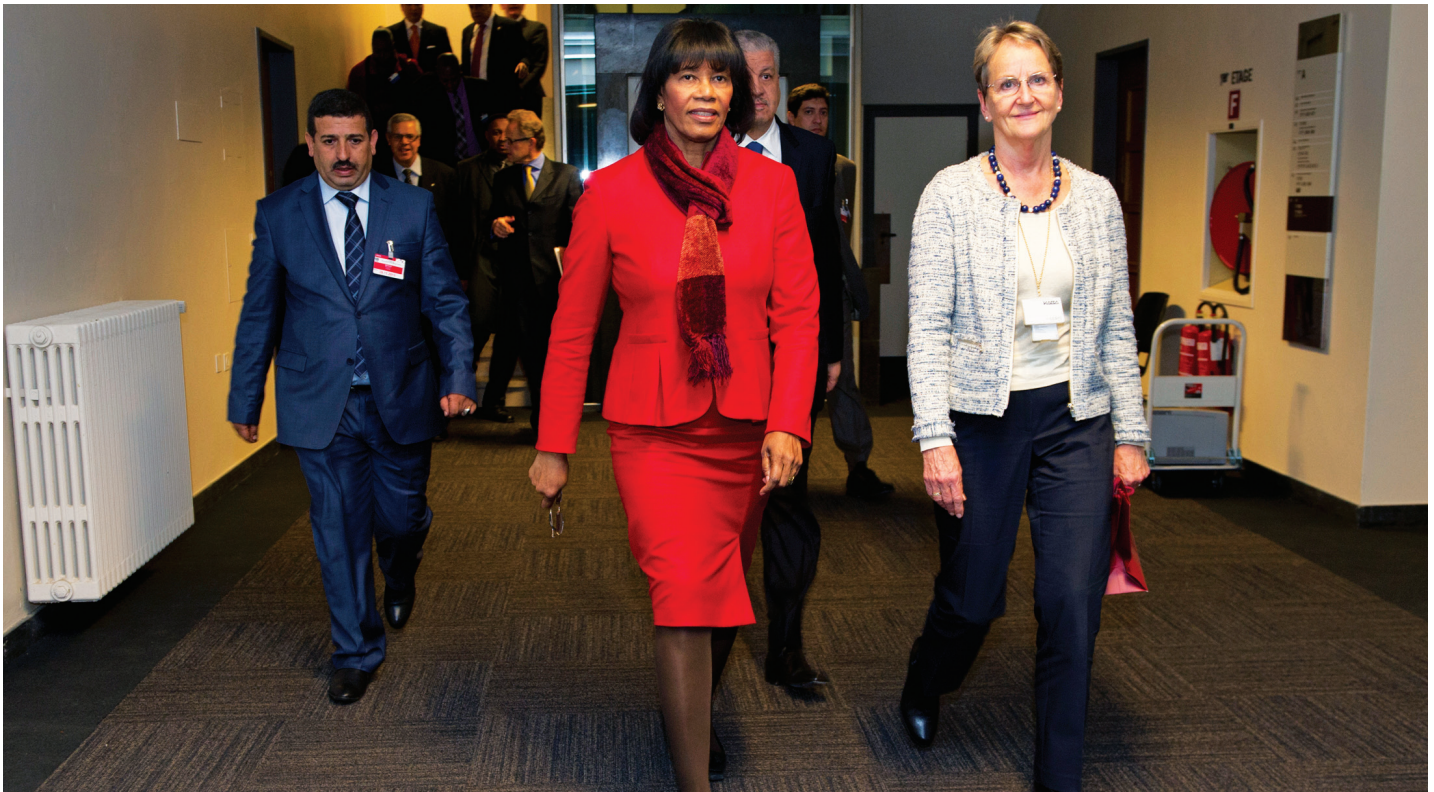
Portia Simpson Miller, Prime Minister of Jamaica, during her arrival to Geneva to participate of the 50th Anniversary of UNITAR.