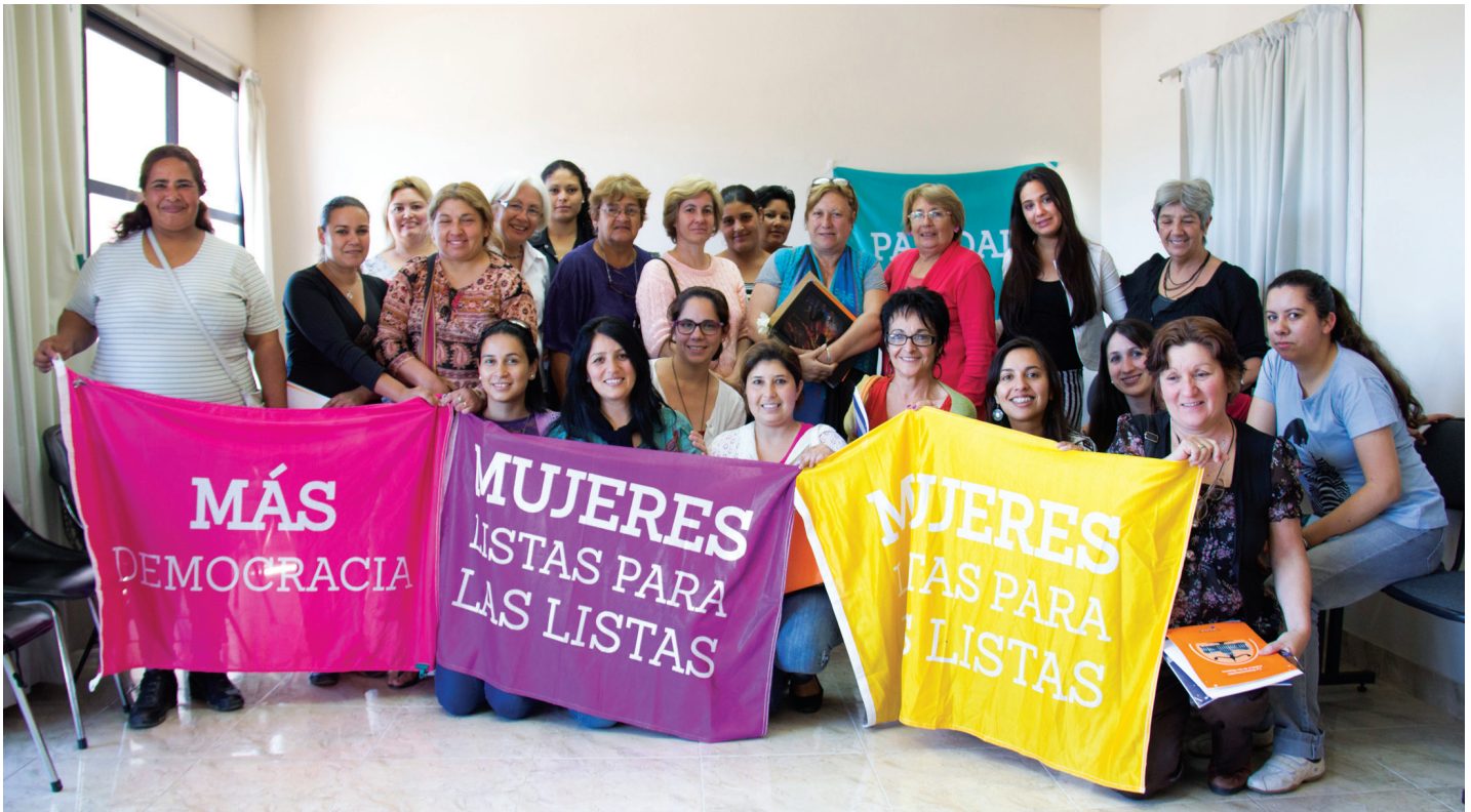
Meeting of women for parity in Uruguay.