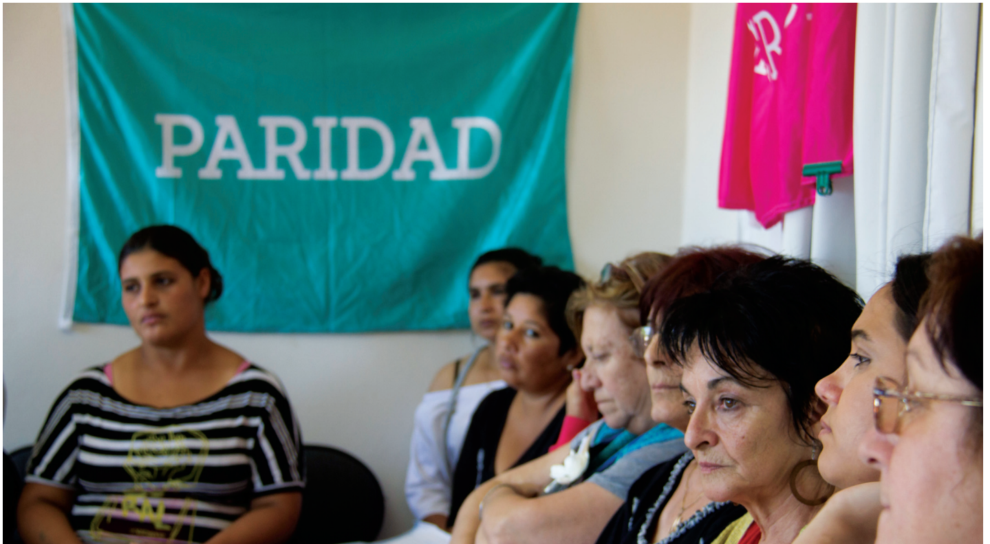
Meeting of women for parity in Uruguay.