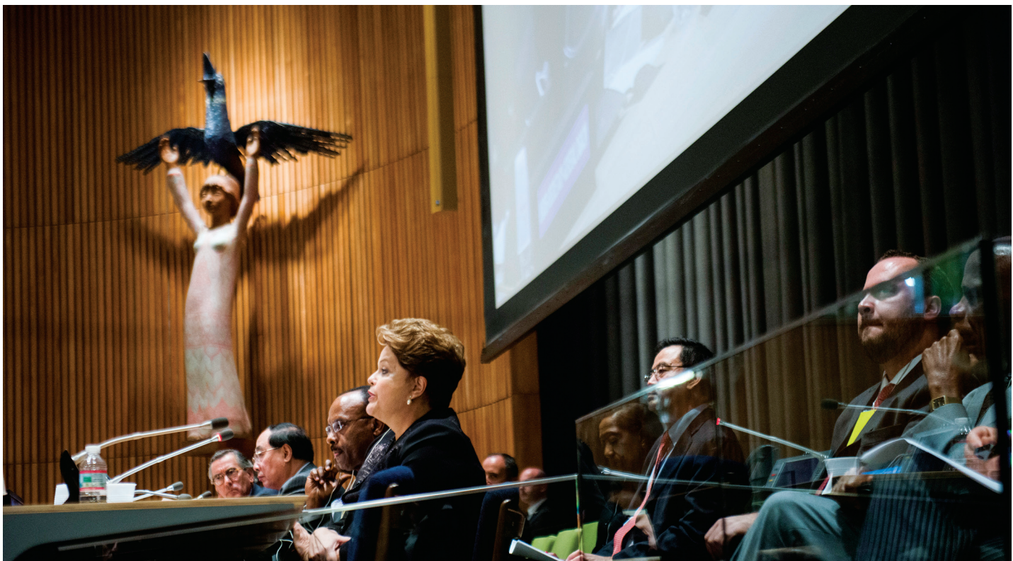
Dilma Rousseff, President of Brazil, addressing the participants during the inauguration ceremony of the High Level Political Forum on Sustainable Development.