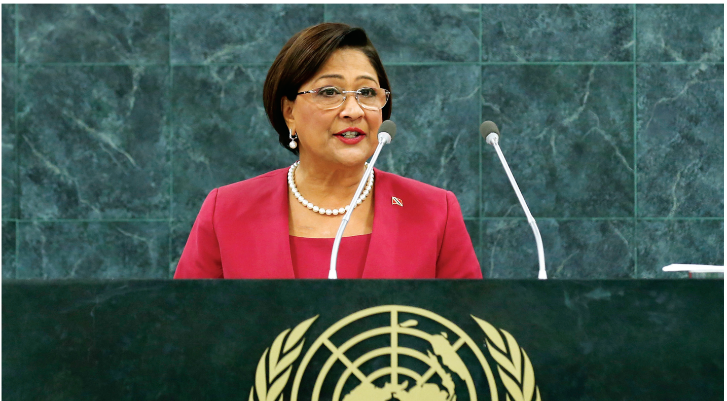
Kamla Persad-Bissessar, Prime Minister of Trinidad and Tobago, addresses the general debate of the 68th General Assembly of the United Nations.