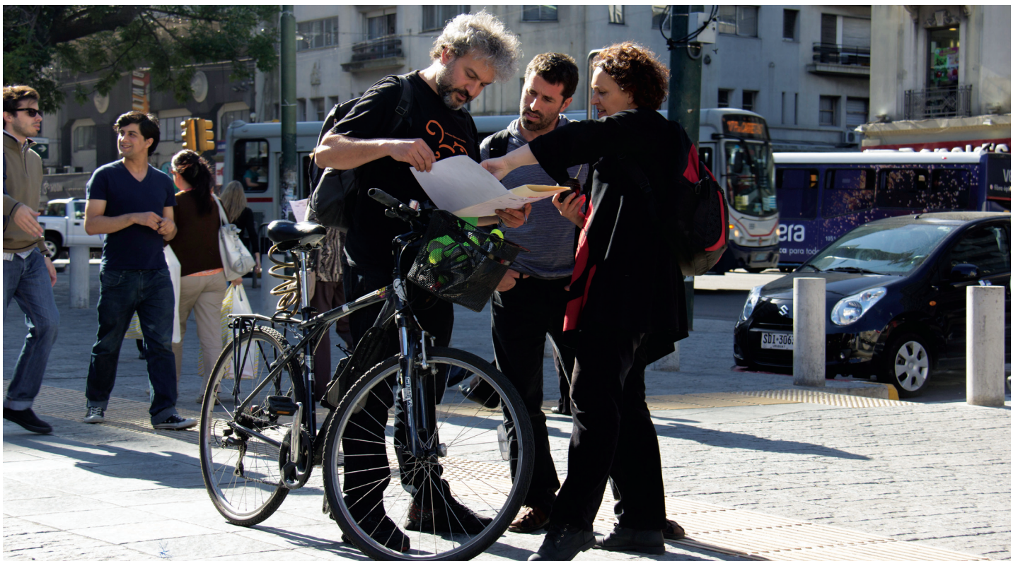
Collection of signatures for parity democracy in Uruguay, organized by Cotidiano Mujer, CIRE and CNS Mujeres, and supported by UN Women.