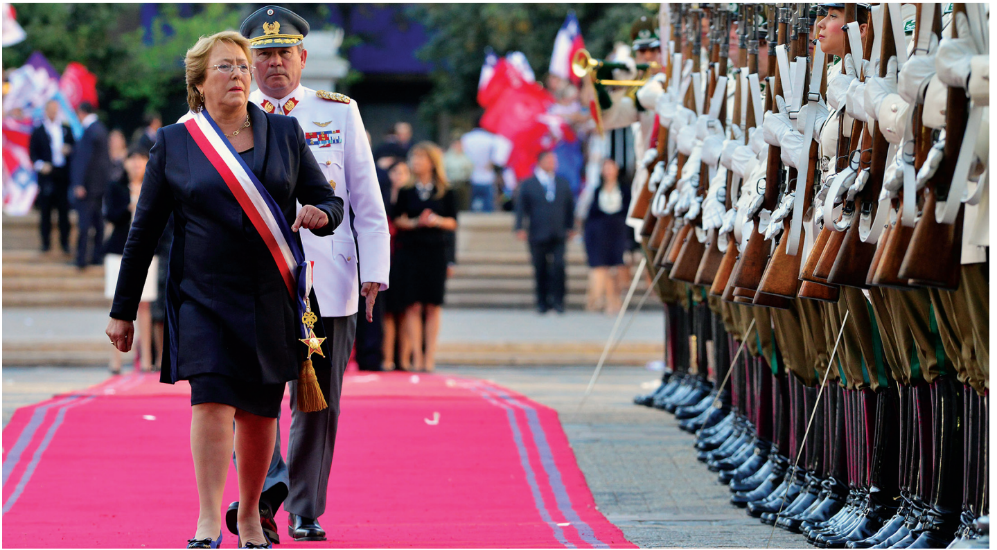
The President of Chile, Michelle Bachelet, arrives at the Palacio de la Moneda.